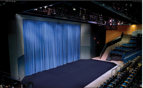
THEATRE 2: 262 SEATS