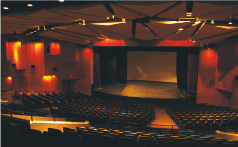
THEATRE 1: 901 SEATS

Experience our virtual tour Visit www.tribecapac.org